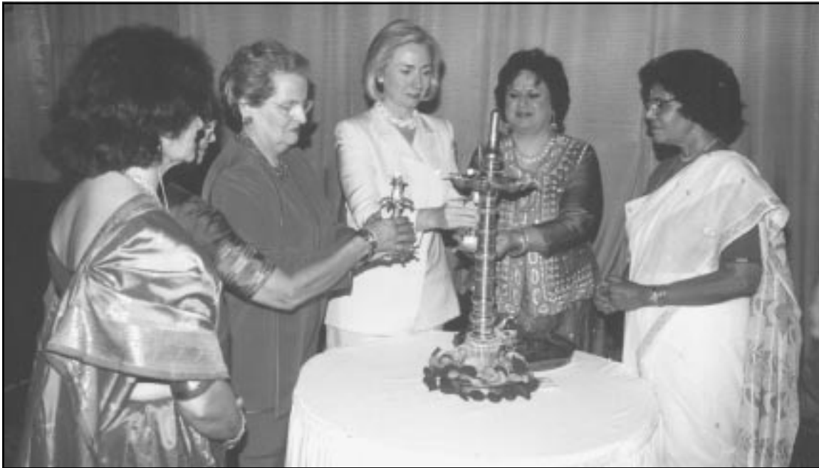
The ceremonial lighting of the lamp by the First Lady Hillary Rodham Clinton to celebrate the 50th Anniversary of India's Independence. Secretary of State Madeleine Albright is with the First Lady. This event was organized by the Embassy of India and National Federation of Indian-American Associations. During the event the First Lady announced that President Clinton plans to visit India in 1998.