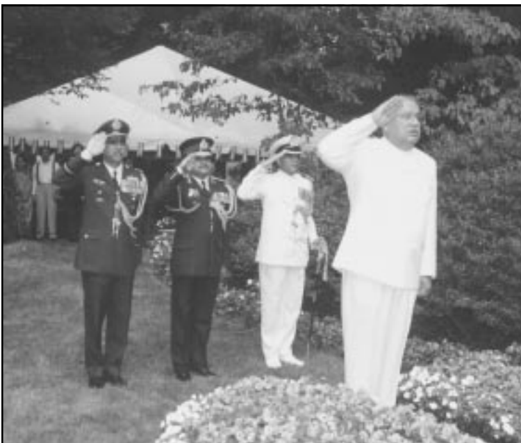
Ambassador Naresh Chandra unfurled the national flag and read President Narayanan's message on India's 50th Independence Day at the Embassy Residence