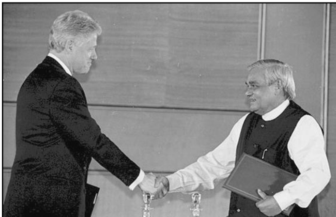
Prime Minister Vajpayee and U.S. President Clinton exchanging the signed documents on "India-U.S. Relations: A Vision for the 21st Century" in New Delhi on March 21, 2000.