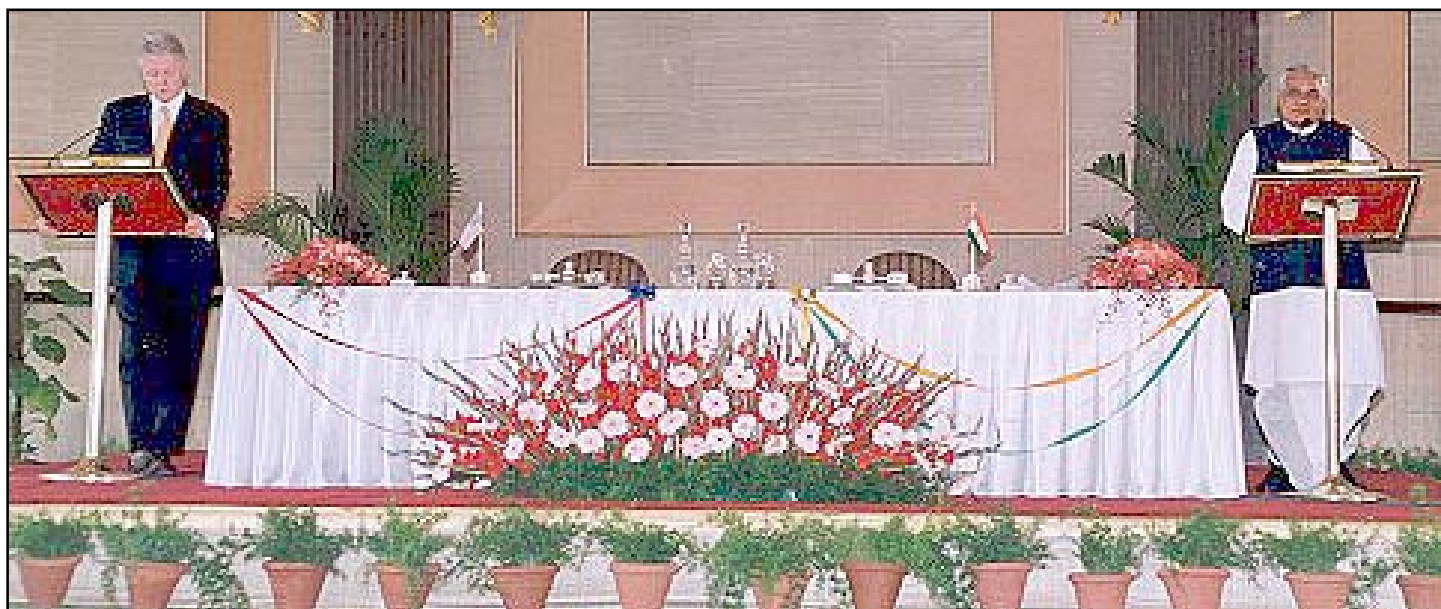
U.S. President Clinton and Prime Minister Vajpayee making a joint press-statement after the signing of India-U.S. vision statement, in New Delhi on March 21, 2000.

With regard to the Comprehensive Test Ban Treaty, you heard the Prime Minister’s statement about his position on testing. I would hope that the democratic process will produce a signing and ultimately a ratification of the Comprehensive Test Ban in India, just like I hope the democratic process will ultimately produce a ratification of the Test Ban Treaty in America that I signed. These are contentious issues. But I’m actually quite optimistic about our ability to make progress on them.”