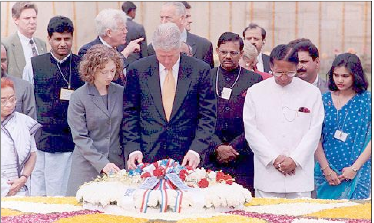
U.S. President Clinton and his daughter Chelsea paying homage at the Mahatma Gandhi Memorial, Rajghat in New Delhi on March 21, 2000.