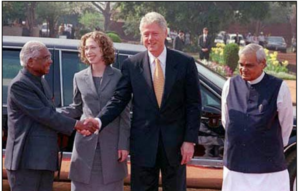
U.S. President Clinton being received by President K. R. Narayanan at a ceremonial reception in New Delhi on March 21, 2000. Prime Minister Vajpayee and the U.S. President's daughter Chelsea Clinton are also seen.

EXIM Bank of the United States also approved a preliminary commitment for $358 million in financing to support the purchase of 10 Boeing aircrafts for Jet Airways of India.