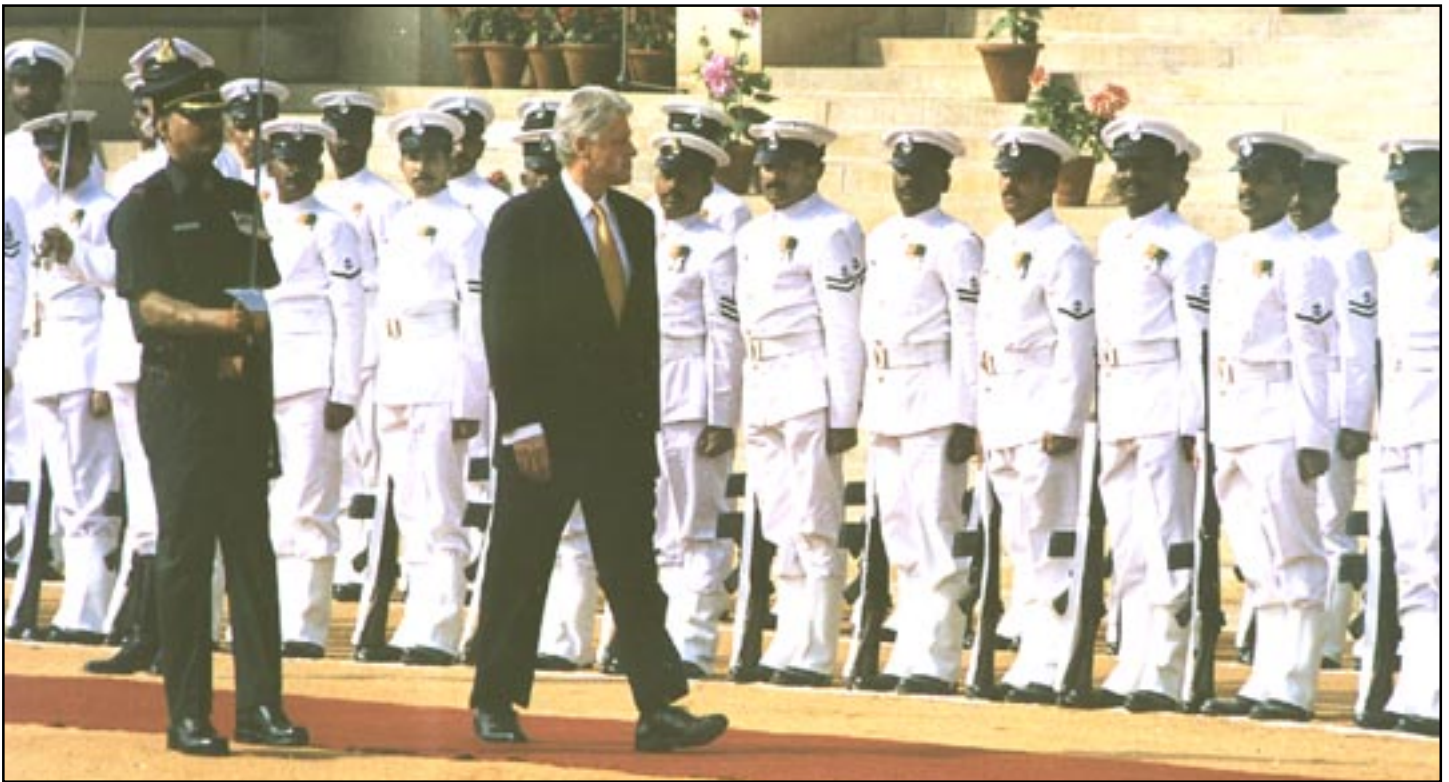
U.S. President Clinton inspecting a Guard of Honor at a Ceremonial Reception, in New Delhi on March 21, 2000.