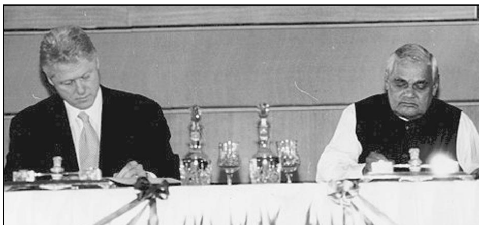
U.S. President Clinton and Prime Minister Vajpayee signing a joint statement "India-U.S. Relations: A Vision for the 21st Century", in New Delhi on March 21, 2000.

At the dawn of a new century, President Clinton and Prime Minister Vajpayee resolve to create a closer and qualitatively new relationship between the United States and India.