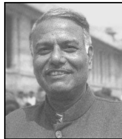
Mr. Yashwant Sinha Finance Minister

The Finance Minister of India, Mr. Yashwant Sinha visited USA in the first week of October as the head of the Indian delegation to attend the Annual Meetings of the World Bank and IMF. This year's meetings were held in the backdrop of the economic crisis in Asia and its spreading tentacles to rest of the world. Speaking at the IMF Interim Committee, the Finance Minister said that "the international financial community seems to be at a loss