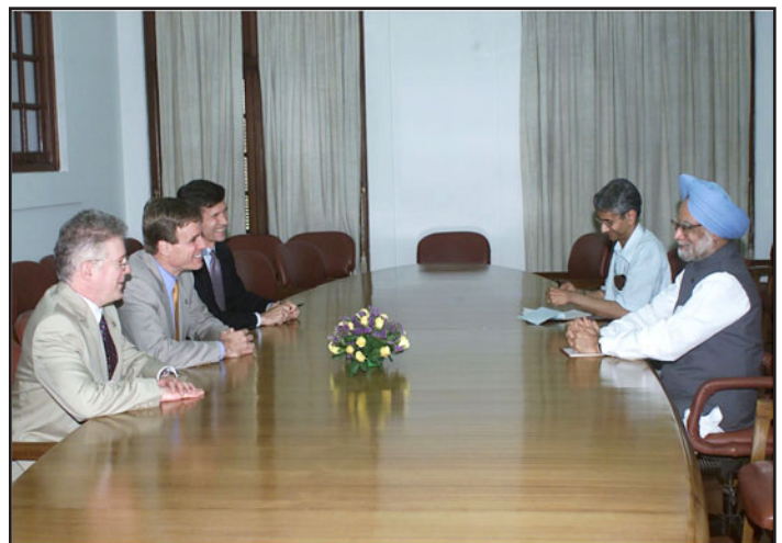
Virginia Governor Mark Warner met the Indian Prime Minister at New Delhi.

A publication of the Embassy of India, Washington, DC